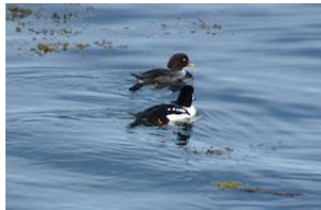
Barrows Goldeneye (1/500th @ f5,6 @ 200 iso)