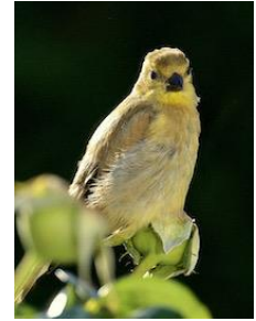
Lesser Goldfinch (1/1250 th @ f8 @ 800 iso)