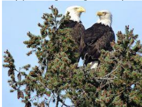
Eagles (1/400th @ f5.6 @ 125 iso)