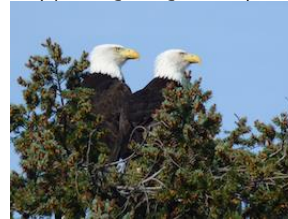
Eagles (1/400th @ f7.1 @ 80 iso)