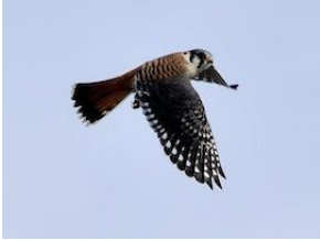
American Kestrel (1/2000 th @ f8 @ 800 iso)

(click on photo caption to see it full size)