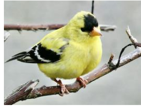
American Goldfinch (1/250 th @ f8 @ 800 iso)