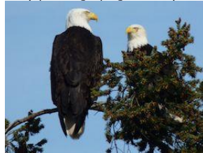
Eagles (1/500th @ f5.6 @ 80 iso)