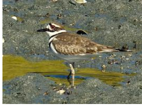
Killdeer (1/500 th @ f8 @ 800 iso)