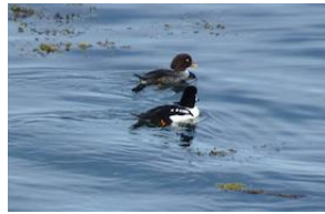
Barrows Goldeneye (1/500th @ f5,6 @ 200 iso)