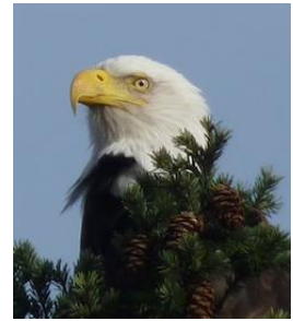
Eagle (1/640th @ f4.4 @ 80 iso)