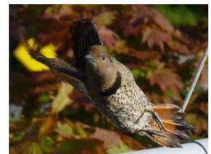
Young Northern Flicker in flight