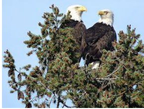
Eagles (1/400th @ f5.6 @ 125 iso)