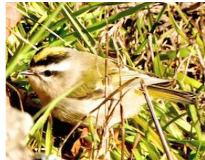
Golden Crowned Kinglet