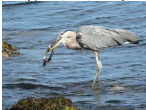
Heron eating the garter snake (1/250th @ f5.6 @ 80 iso)