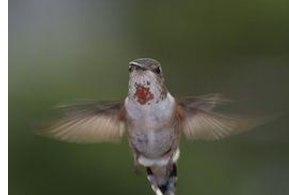
Hummingbird (1/200th @ f11 @ 800 iso flash 1/32 power)