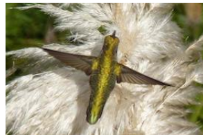
Hummingbird (1/1300th @ f6.3 @ 200 iso)