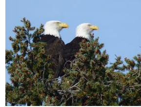
Eagles (1/400th @ f7.1 @ 80 iso)