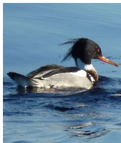
Red Breasted Merganser (1/500th @ f5.6 @ 200 iso)