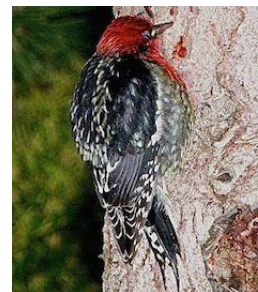
Red Breasted Sapsucker (1/250th @ f8 @ 1600 iso flash TTL)