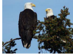
Eagles (1/500th @ f5.6 @ 80 iso)