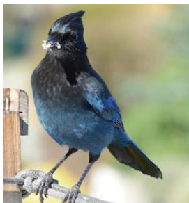
Stellar's Jay (1/500th @ f11 @ 800 iso)