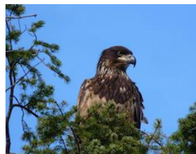
Young Eagle (160th @ f4.4 @ 125 iso)