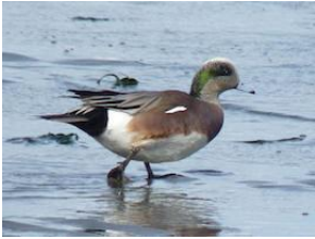
American Widgeon (1/800th @ f4.4 @ 125 iso)

(click on photo caption to see it full size)