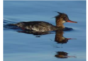
Red Breasted Merganser (1/500th @ f5.6 @ 80 iso)