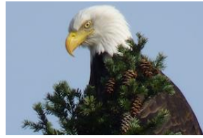
Eagle (1/800th @ f4.4 @ 100 iso)