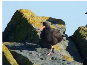
Oyster Catcher (1/250th @ f5.6 @100 iso)