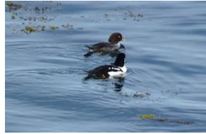
Barrows Goldeneye (1/500th @f5,6 @ 200 iso)