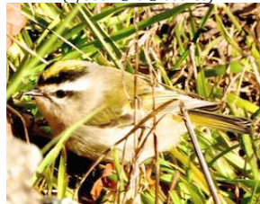
Golden Crowned Kinglet