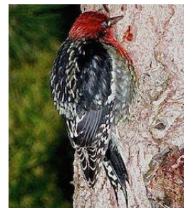
Red Breasted Sapsucker (1/250th @f8 @ 1600 iso flash TTL)